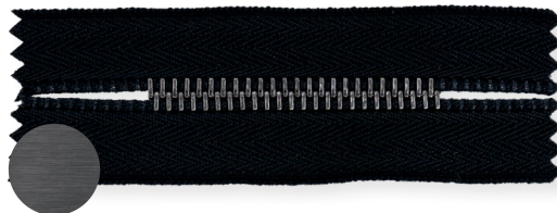
Signature Lux Gunmetal