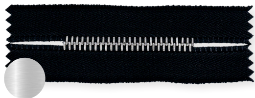
Signature Lux Silver