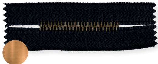
Signature Lux Antique Brass