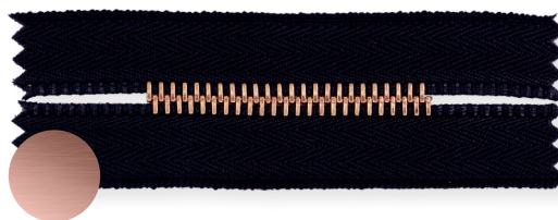
Signature Lux Rose Gold