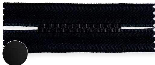
Signature Lux Black Ox