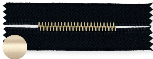
Signature Lux Pale Gold