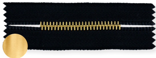
Signature Lux Gold