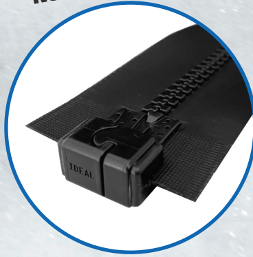
#5 SQS W/ Water-Repellent Tape